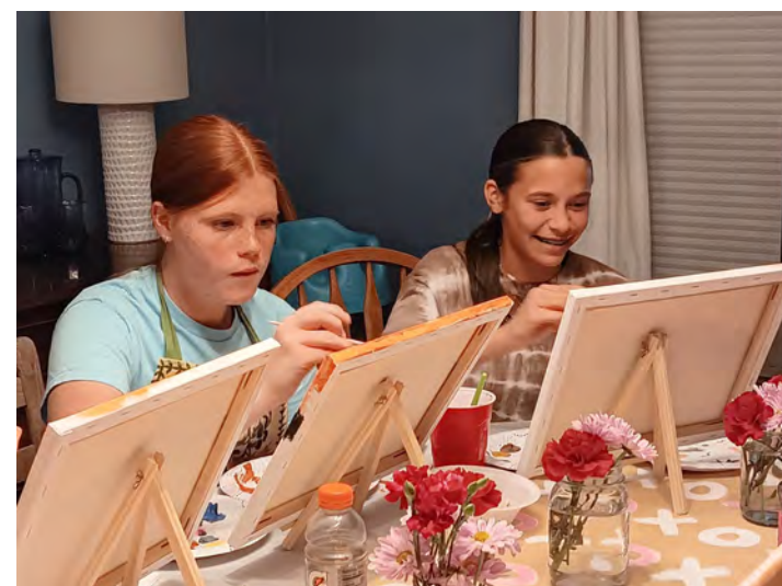
GALENTINE'S : Girl's Hang Out