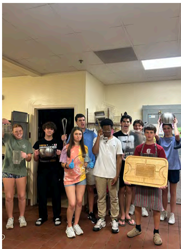
Pancake Brupper at ROW