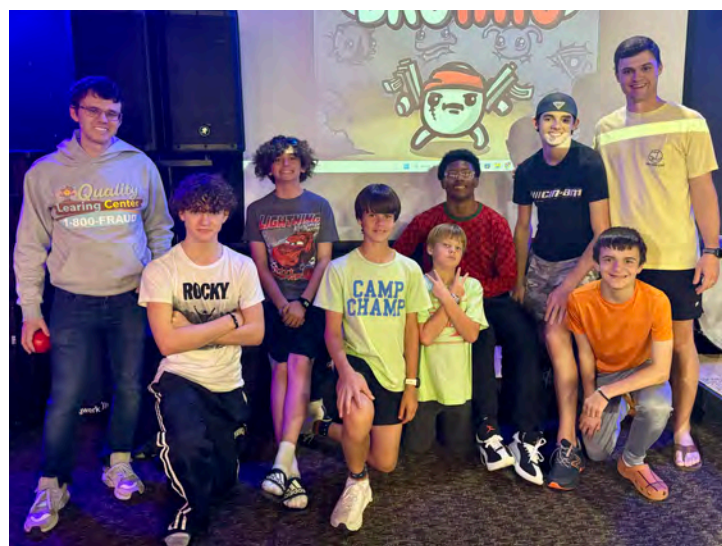
BROTATO NIGHT : Guy's Hang Out

Thank you for your continued support and prayers for our student ministry! See some of the pictures attached to get a glimpse into what we've been up to! ■