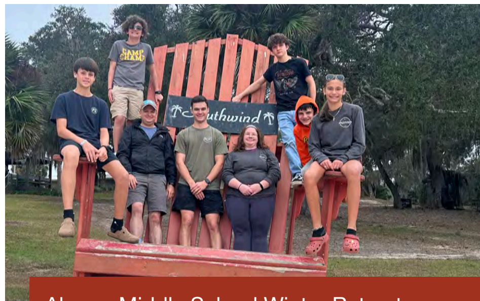
Above: Middle School Winter Retreat